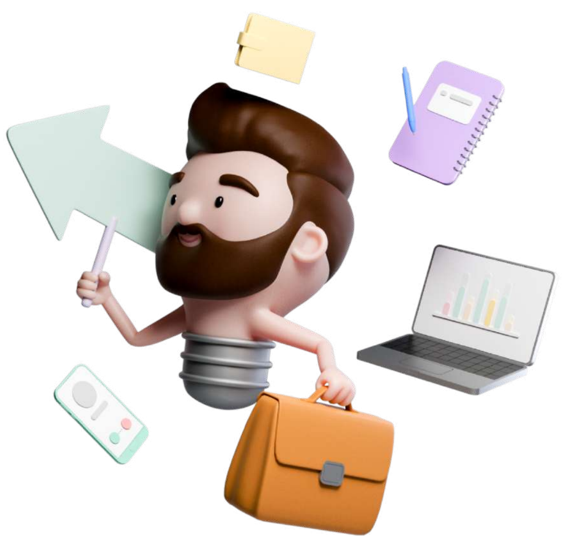
Figure out what success looks like for your side business. You want to earn extra income, but do you know what the realistic expectation is? Once you've earned enough to do what you set out to accomplish (decreasing your debt, funding a major purchase, etc.), will you keep going? And if it takes longer than expected to achieve those goals, what are your plans for regrouping and reworking